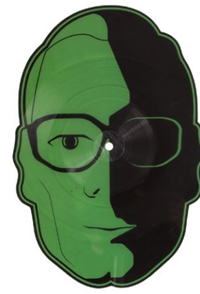
SHAPED PICTURE DISCS

Each custom shaped vinyl is a unique product, and so we will work with you to bring your design idea to life