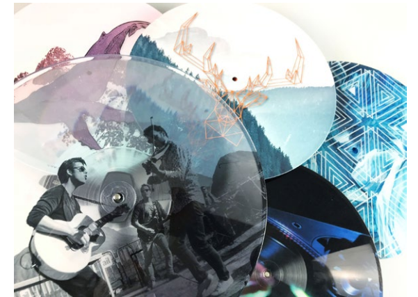
UV PRINTED RECORDS

Take your shaped vinyl idea one step further and make it a shaped picture disc!