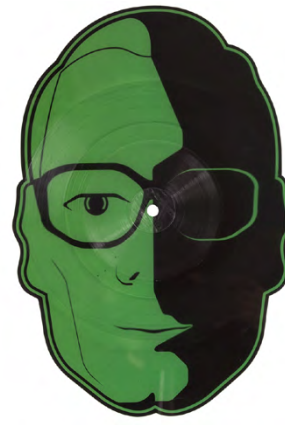
SHAPED PICTURE DISCS

Each custom shaped vinyl is a unique product, and so we will work with you to bring your design idea to life