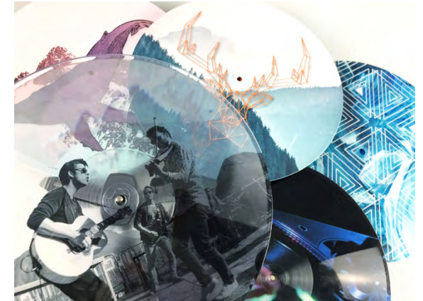
UV PRINTED RECORDS

Take your shaped vinyl idea one step further and make it a shaped picture disc!